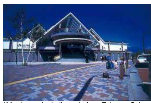
(80 minutes by bullet train from Tokyo to Sakuradaira station)