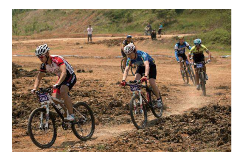
Chun'an Jieshou Sports Centre Mountain Bike Course